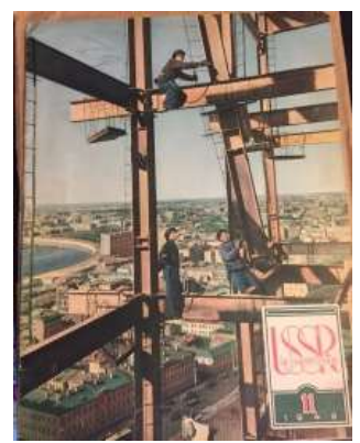
Examples of late 19th and early 20th Century materials from the Sciacca Collection.

Also included in the Sciacca Gift was examples of pre-Revolutionary and Soviet-era realia, including mid-19<sup>th</sup> century badges for village and volost ' elders, medals worn by elected officials in provincial cities, and various commemorative medals, coins, and porcelain. This is unquestionably one of the more significant collections of early imprints and imperial realia to come to the Columbia Libraries. I am grateful to Professor Sciacca for donating this diverse collection to Alma Mater!