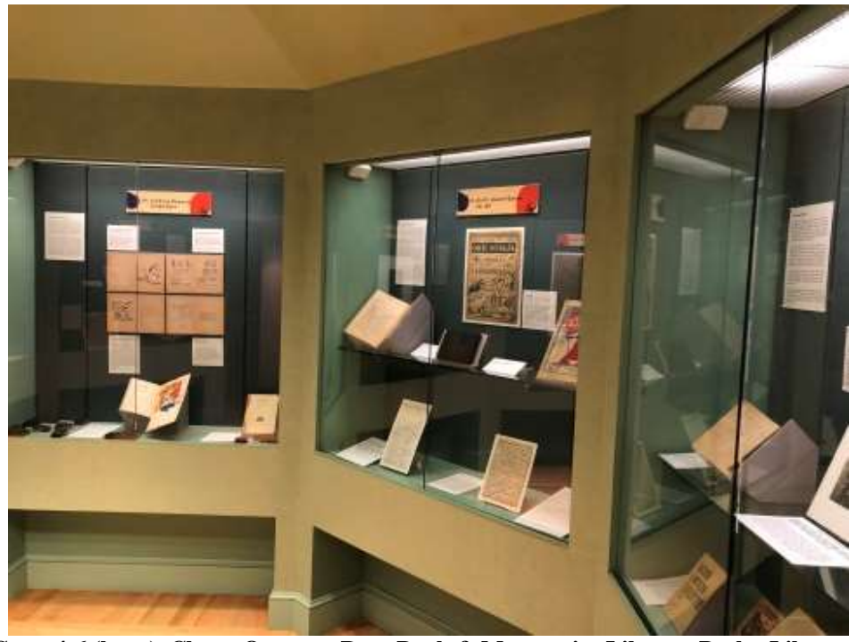
View of Cases 4-6 (l to r), Chang Octagon, Rare Book & Manuscript Library, Butler Library 6<sup>th</sup> Floor.