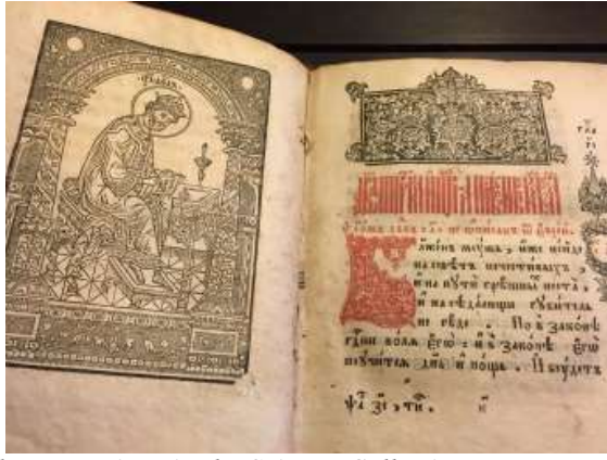
A sampling of early Slavonic books and manuscripts in the Sciacca Collection.